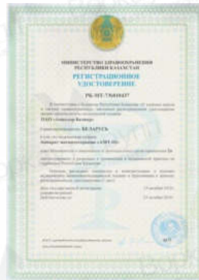
The Republic of Kazakhstan