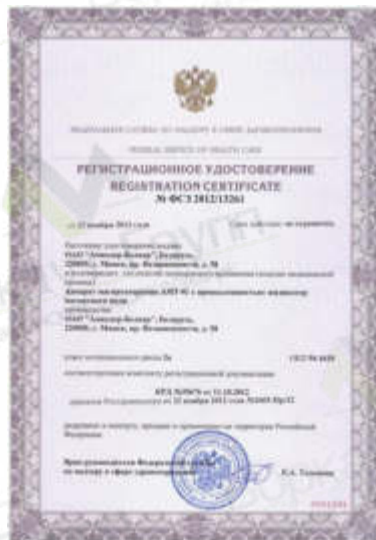
The Russian Federation