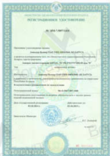
The Republic of Belarus